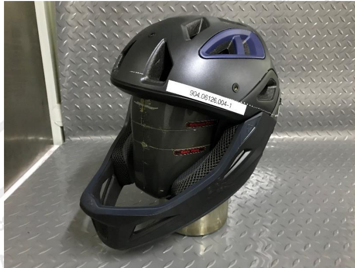
904.06126.004 – LT1701-MTB ENDURO 3.0 (Multi)